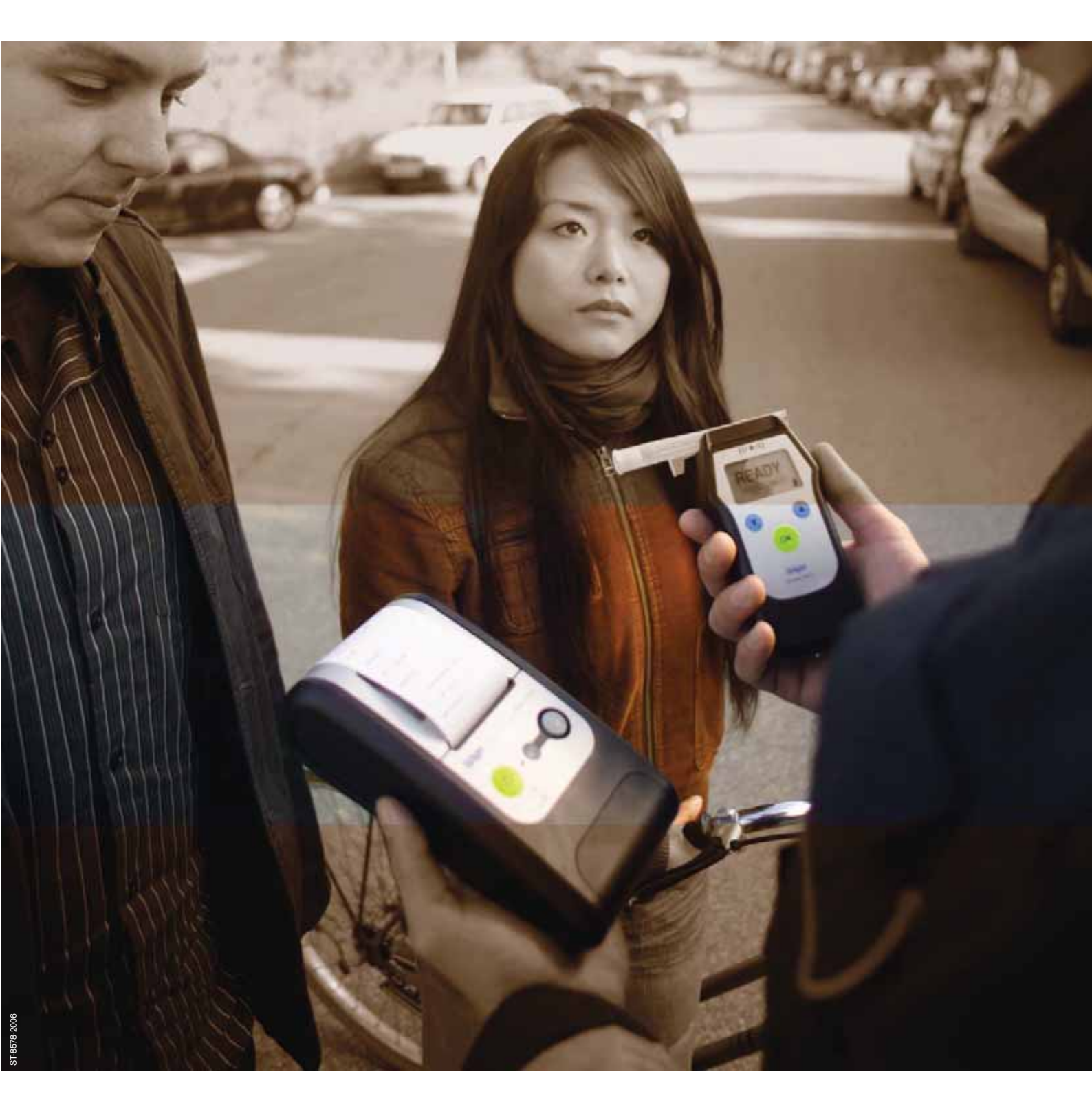
THE PERFECT TEAM.

DRÄGER ALCOTEST 6810 AND THE DRÄGER MOBILE PRINTER.