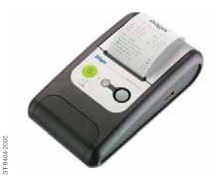
Printout of results